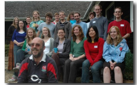
Wycliffe Connect group

In early September, fourteen 18-25 year-olds came together to encourage each other in their passion for Bible translation and mission. During the weekend we thought more about Bible translation and how it honours / honors* God and reflects his character, as well as reminding us of the ultimate translation – Jesus, as God into humanity!